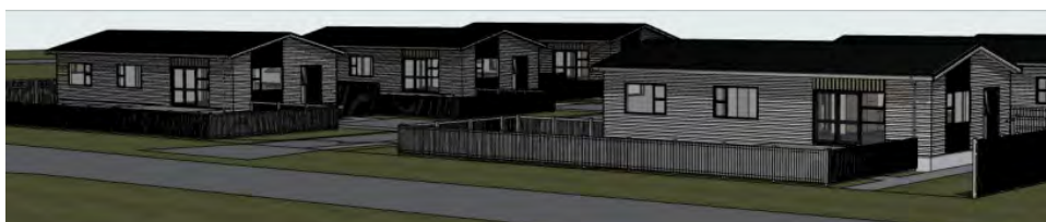
Broadway Road, Matamata

Kāinga Ora currently has 185 homes in Matamata-Piako District. The Residential Tenancies (Healthy Homes Standards) Regulations (2019) sets out minimum standards for heating, insulation, ventilation, moisture ingress/drainage, and draught-stopping. Kāinga Ora has to ensure all homes across our portfolio comply with these standards by 1 July 2024. Work is underway in the District to ensure all our homes meet these standards. As at 30 June 2023, 149 now comply, 11 have work in progress and the 25 remaining homes will be addressed before July 2024.